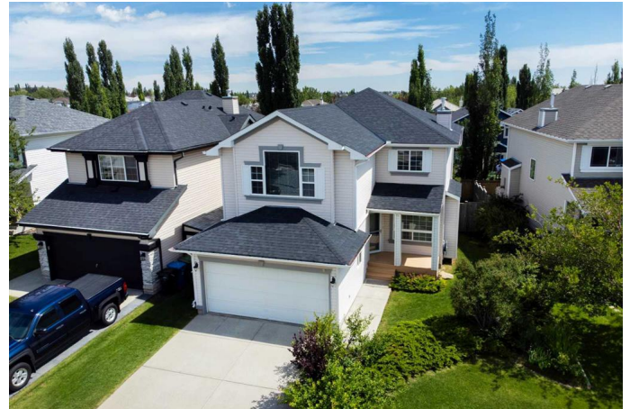
26 Rocky Ridge Heights NW, Calgary, AB

Double attached insulated garage with work bench and shelving. House is in a quiet street,